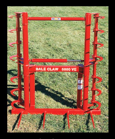
ProAG Bale Claw 5000VE The Bale Claw mounted to a loader moves bales easily from an existing stack to a truck, shed or bagger. The 5000VE will pick up three 3x3 bales, three 3x4 bales, or two 4x4 bales from the end of the stack for loading onto a truck.