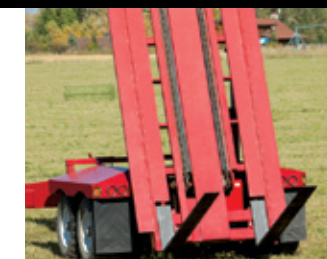
Strong and sturdy forks hold the bales in place while stacking and unloading.