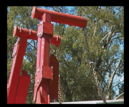
Optional Short Bale Bracket attachments can be mounted on the alignment arms to pick up shorter wet silage bales.