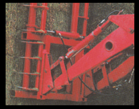
Loading truck with three 3x3 large square bales.