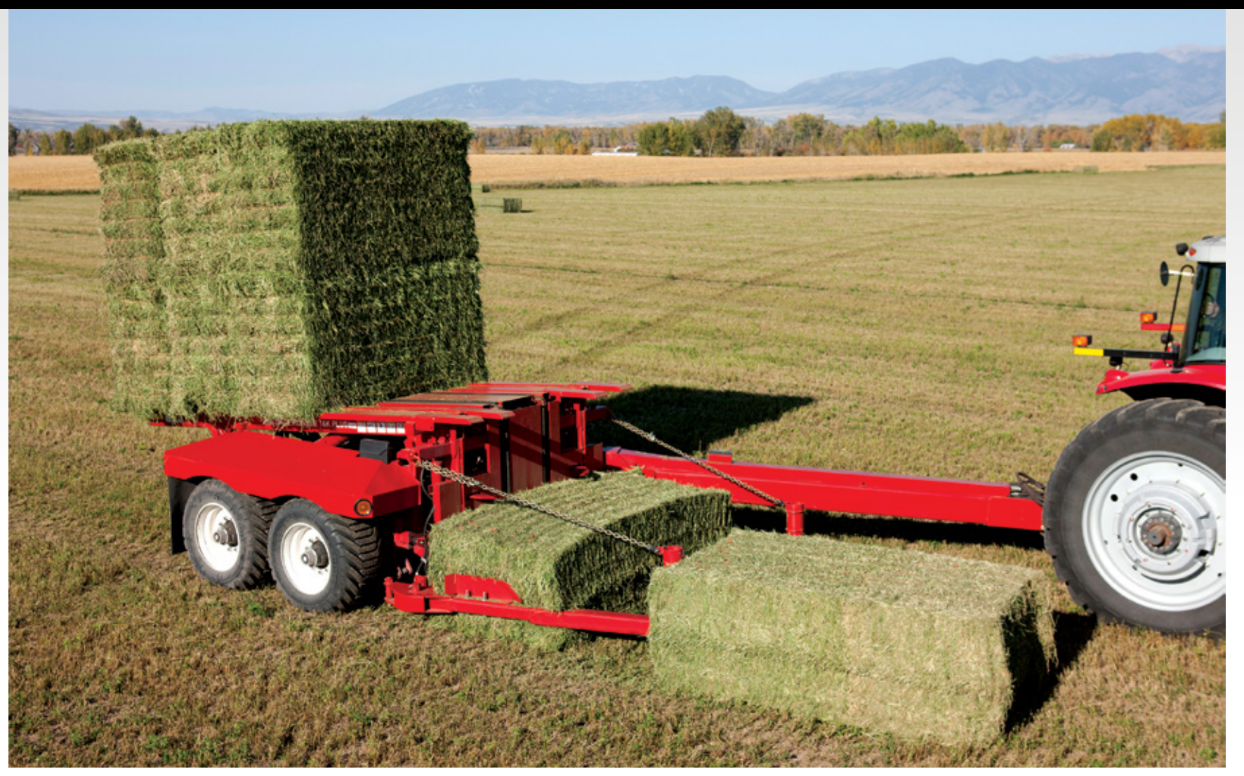
The Auto Align® Bale Runner is designed and built tough for demanding conditions. Speed, reliability and user friendliness make the 16K PLUS the most efficient large square bale picker/stacker for your operation. Fewer moving parts means lower maintenance.